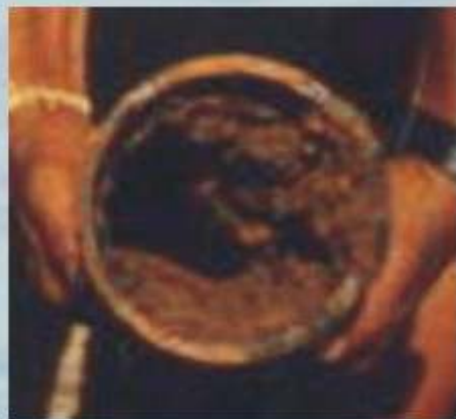
Picture seen above shows piping with Carbonate Scaling before SOLAVITE implementation

Chemist, Linus Pauling, Nobel Prize Winner, states that people are skeptical of the effectiveness of a catalytic action until they see the results. While a precise scientific explanation of how a particular catalyst works may be lacking, accomplishments and results can be readily demonstrated in actual use.