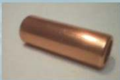
Example of SOLAVITE Cell

This process does not cause corrosion nor does it cause electrolysis. The catalytic action simply presents mineral deposition and removes that which exists without changing the chemical properties of the fluids.